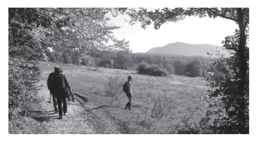
Fig. 2. Tourists on "Krzysie" clearing, heading Luboń Wielki

The statistics presented above prove the fact that only a small percentage of tourists hiking up to Luboń Wielki summit familiarise themselves with a map of the region and the trails or gaine any information about them. This statement can be supported by the way the tourists chose the trails: the yellow trail, with a lot of tourists attractions, was chosen as often as the red and blue ones, described in the literature as not that interesting and picturesque (Matuszczyk 2004). The number of tourists on particular trails (table 5) proves the thoroughness of choosing the interesting trails to hike the tourists coming from distant parts of Poland, in contrast to tourists from Małopolska, who have strictly recreational purposes.